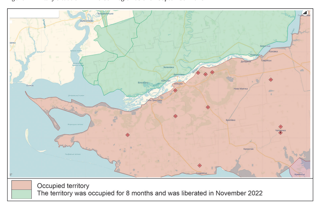
Figure 1. Military situation in Kherson region as of 01 September 2023

As of November 2023, 812 protected natural resource sites have been damaged by the war; the damaged sites are 900,000 hectares or 22% of the total area of nationally protected natural territories. According to the Ministry of Environmental Protection and Natural Resources of Ukraine, 514 nature-protected sites taking 800,000 hectares are still under occupation. Both estimates are subject to a high degree of uncertainty as a significant part of Ukrainian territory is taken up by ongoing heavy fighting, and even more significant parts are unapproachable because of the unprecedented number of land mines.